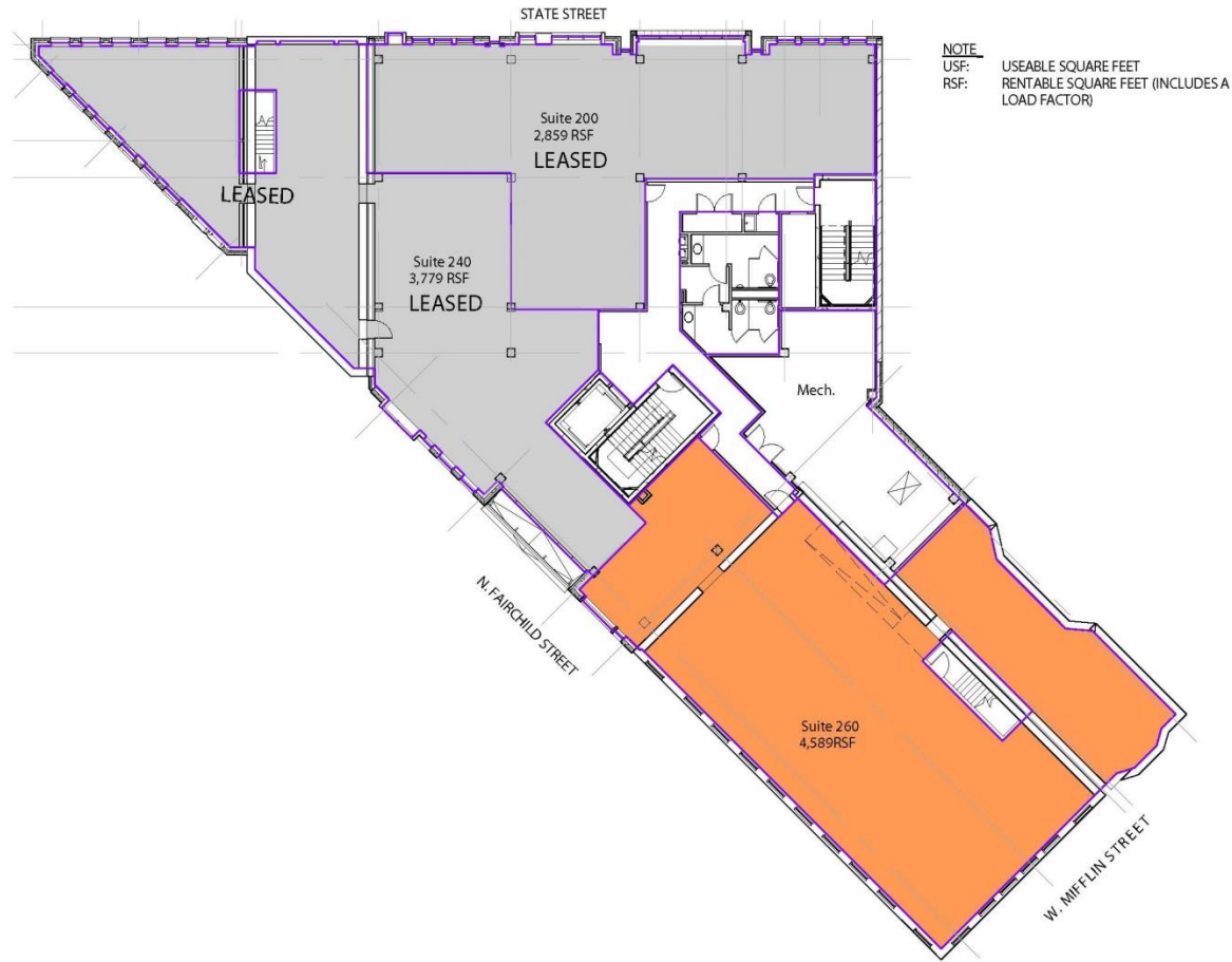
SECOND FLOOR - BUILDING AREAS PLAN BLOCK 100 FOUNDATION PROJECT