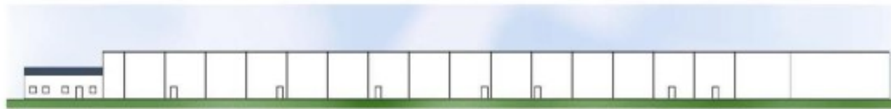
WEST ELEVATION (KOHLMAN ROAD)